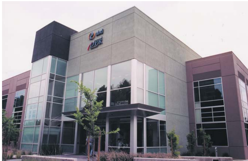
Above: The 52,300-square-foot DPR/APD building in Sacramento, Calif., uses innovative HVAC technologies for its heating and cooling needs; Below: A sign pointing out some of the facility's “Green Features” hangs in one of the facility's many offices.

DPR Construction, Inc. designed, built and occupies the first privately owned office building in Sacramento with Leadership in Energy and Environmental Design (LEED) certification, a program of the U.S. Green Building Council. Completed in October 2003 as a design/build project owned in conjunction with ABD Insurance and Financial Services, the 52,300-